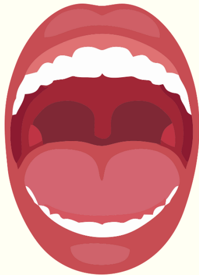
1. Mouth/ Throat

This means that nothing should be administered or entered, whether liquid or solid, medicinal or nutritional etc. through any passage prescribed by Shariah as a passage leading directly to the stomach. [Passage of Consequence]