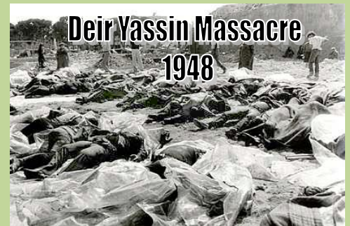
Deir Yassin Massacre 1948

By 1949 CE -, some 750,000 Palestinians had become refugees and several tens of thousands had become internally displaced in their own homeland. Only some 150,000 of them had remained behind only to be subject to Israeli rule.